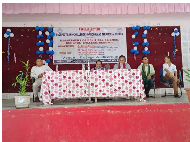
A Snap shot of the Resource Person sitting on the Dias during the Program.