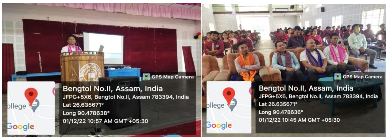
A glimpse of Faculty Exchange Program